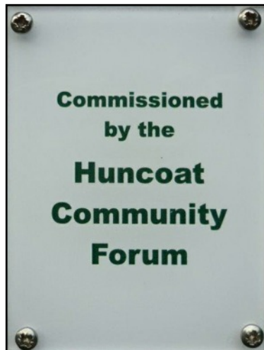
Signpost 446 and plaque detail

Meanwhile I've done some maintenance on older signs as follows :